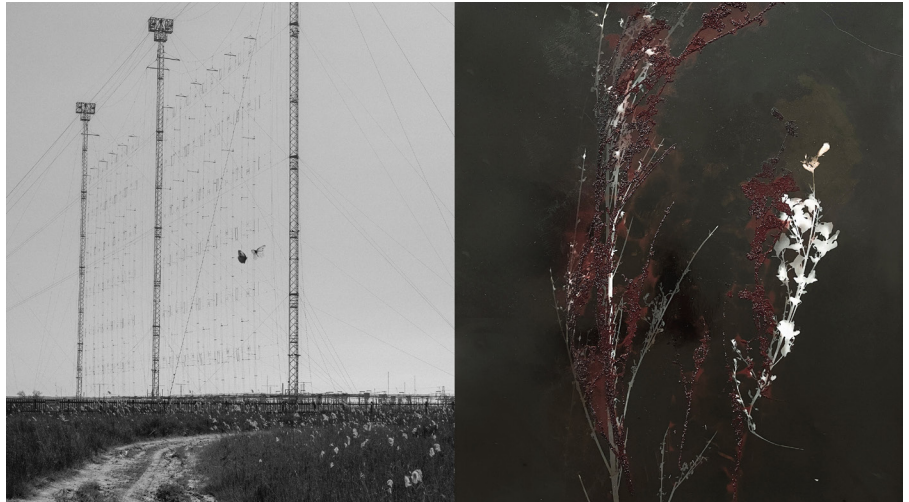
Butterflies (Haarp) , 2020 © Stelios Kallinikou / Lupin, Fougère, Genêt , gelatine silver print, silkscreen, 2024 © Susanne Kriemann, VG Bild-Kunst, Bonn, 2025

In his new project, Stelios Kallinikou (b. 1985) explores Akrotiri Salt Lake, which forms part of a British military base as an overseas territory on Cyprus. The lake is an important wetland habitat in the eastern Mediterranean region, located in close proximity to some of Cyprus's oldest archaeological sites, and a key wetland habitat for countless flora and fauna. Kallinikou conveys the tensions between military exploitation, ecological fragility, and cultural heritage in this place by interweaving multiple time periods. Incorporating photography, film, and sculpture, his project makes visible the complex relationships between land, borders, and sovereignty, inviting viewers to reflect on colonial legacies at Europe's outer edge. Susanne Kriemann's (b. 1973) project ties into her longstanding engagement with uranium and the atomic age. She uses pitchblende—also known as uraninite, and one of the most ancient minerals found on Earth—as a starting point to reflect on geological and atomic timescales through photography, research, and poetry. Her work incorporates early photographic processes including autoradiography, screenprinting, and heliography, combining the abstract effect of radiation on photosensitive materials with poetic texts and site-specific staging. Her project opens up a critical interplay between the visual world and the use of radioactivity, allowing viewers to understand the emission's central role in the relationship between humans and the environment.