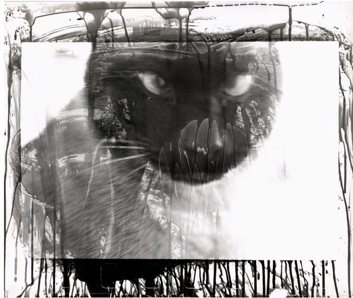
Katze, 1980