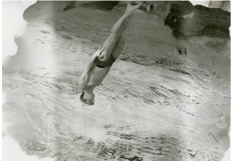
Grosser Flieger , 1983

In Dörte Eißfeldt's (b. 1950) images, things aren't always what they seem, and nothing stays what it is for too long. Rather than assuming verisimilitude, photography, in her work, becomes synonymous with transformation. Equipped with a tender, poetic, and ever-curious gaze, Eißfeldt explores our surrounding world, human bodies, and the medium itself. A snowball melts in one image, in another it seems to turn rock-like and celestial. A knife blade appears as a megalith, surfaces shift in texture—skin turns metallic, then fragile and porous. Again and again, Eißfeldt explores how photography questions itself, transforms, and pushes the limits of perception. The title of the exhibition refers to a quote by Eißfeldt, in which she writes: "Photos are like whales that can carry entire islands." The exhibition gives space to this archipelago of islands—carried by the photo whales: islands of meaning, memory, similarity, or the impression of a moment. Spanning over five decades, and encompassing key works from her personal archive, large-scale series, as well as unpublished and never-before-shown sketches, artist books, and notepads, C/O Berlin presents a long-awaited major institutional exhibition of her work. Curated by Boaz Levin.