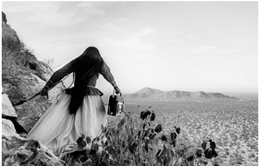
Mujer ángel, Sonoran Desert, 1979 © Graciela Iturbide

C/O Berlin presents the first major retrospective of Graciela Iturbide's (b. 1942) work in Berlin, offering an in-depth exploration of one of Mexico's most significant photographers. Developed in close collaboration with the artist, the exhibition features her iconic series as well as works never seen before, presenting an overview of more than five decades of her oeuvre. Iturbide documents Mexican culture and illuminates the role of women across many contexts. These include women-led Zapotec communities in Juchitán, Oaxaca which dispense with gender stereotypes, as well as her examination of Frida Kahlo and her Casa Azul, which transcend myths surrounding the artist's life. Her other central groups of work look at the indigenous Seri community in northwestern Mexico, the La Matanza ritual performed in the Mixteca region, as well as seldom-shown photographs taken on travels in India and Bangladesh. While her work often chronicles the people and cultures on which she has chosen to focus, her poetic sensibility inspires a more transcendent perspective than pure documentation. The retrospective captures how her unique photographic practice has evolved, resonating far beyond Mexico itself. Curated by Sophia Greiff and Melissa Harris.