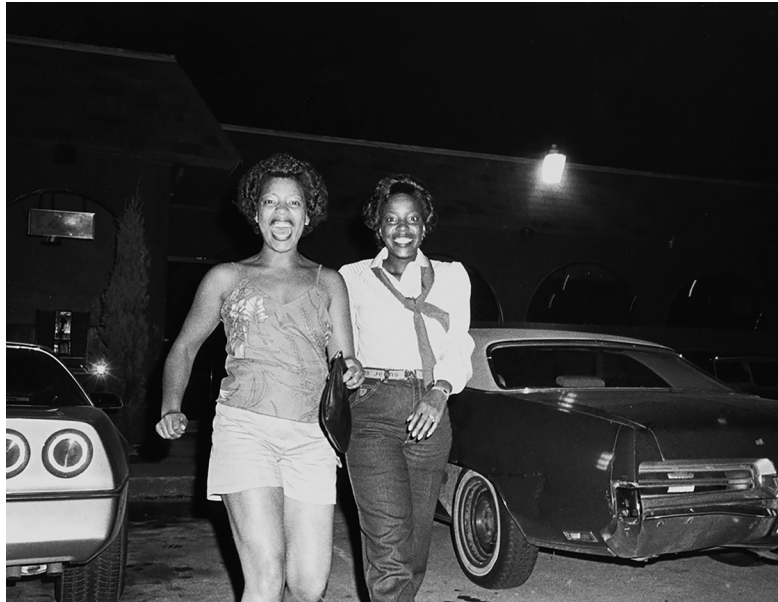
Welcome Home, 1978–84