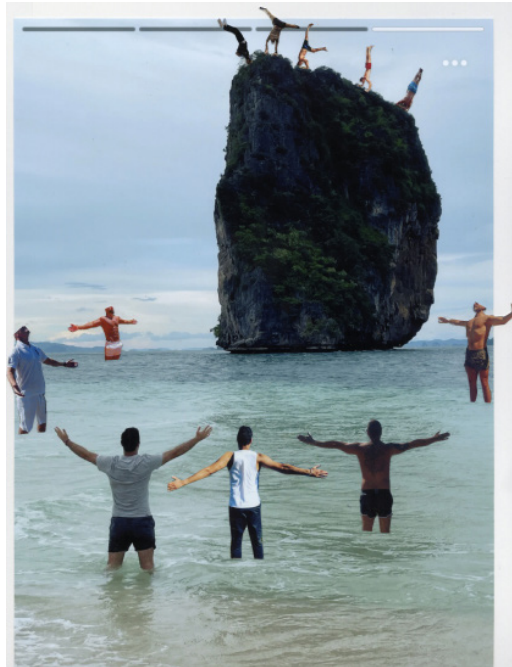
A MILF DREAM - my matches on tinder, 2024

How do images bait or beguile us as they circulate online? How do they compel, capture or control us? The 14 artistic positions presented in the exhibition engage with visual phenomena that serve as vehicles for online communication, criticism and humour, highlighting the crucial role images play in shaping our social, cultural and political landscapes. The show invites you to explore the visual worlds of social media feeds, dating app profiles, beauty filters, memes, ASMR videos, 'cute' and 'cursed' images, emojis, computer-generated imagery and low-resolution screenshots used for conspiracy or protest. The artistic positions track the complex mechanisms of the lure, shedding light on how images and their underlying structures—from algorithms to datasets—direct our attention, provoke emotions and influence opinions.