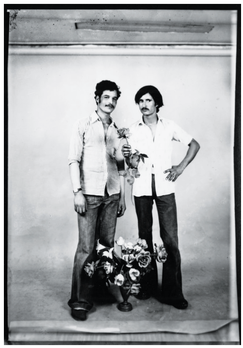
Studio Rex

Jean-Marie Donat Collection Jun 1 – Sep 5, 2024