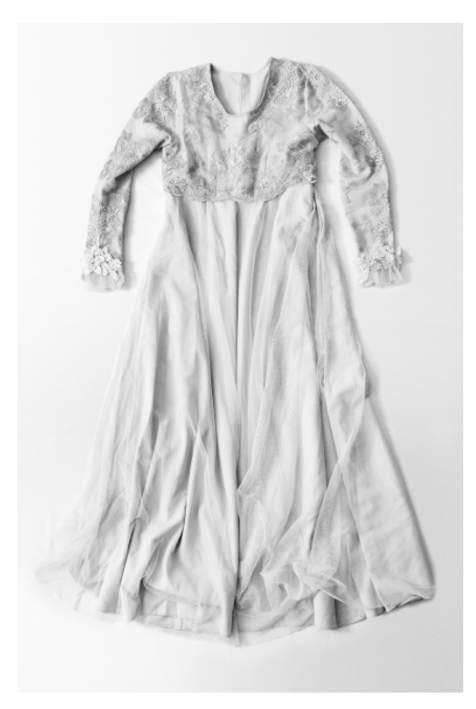
Ala Kachuu (Bride Kidnapping), Kyrgyzstan, 2019

On Rape - And Institutional Failure Jan 27 - May 22, 2024