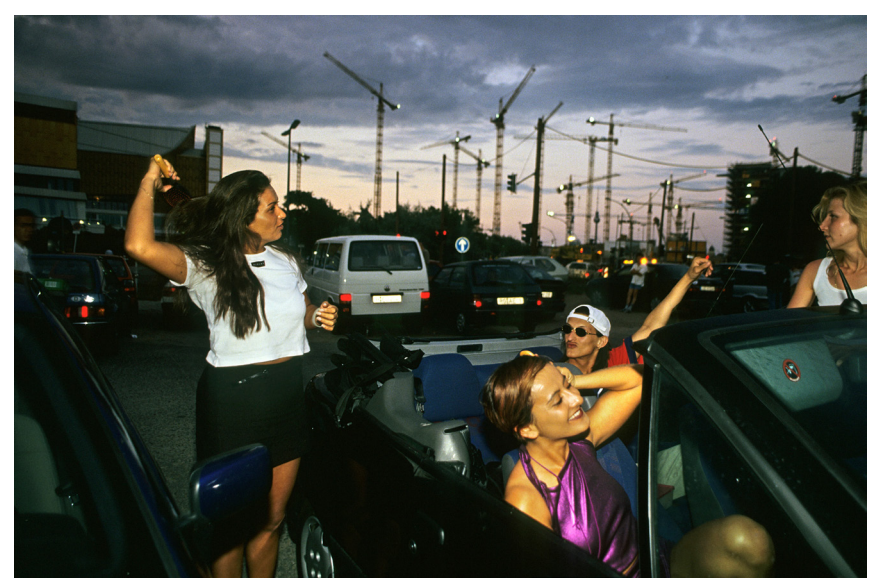
At the fringe of the Love Parade, Berlin, 1997

OSTKREUZ - Agentur der Fotografen Sep 14, 2024 - Jan 23, 2025